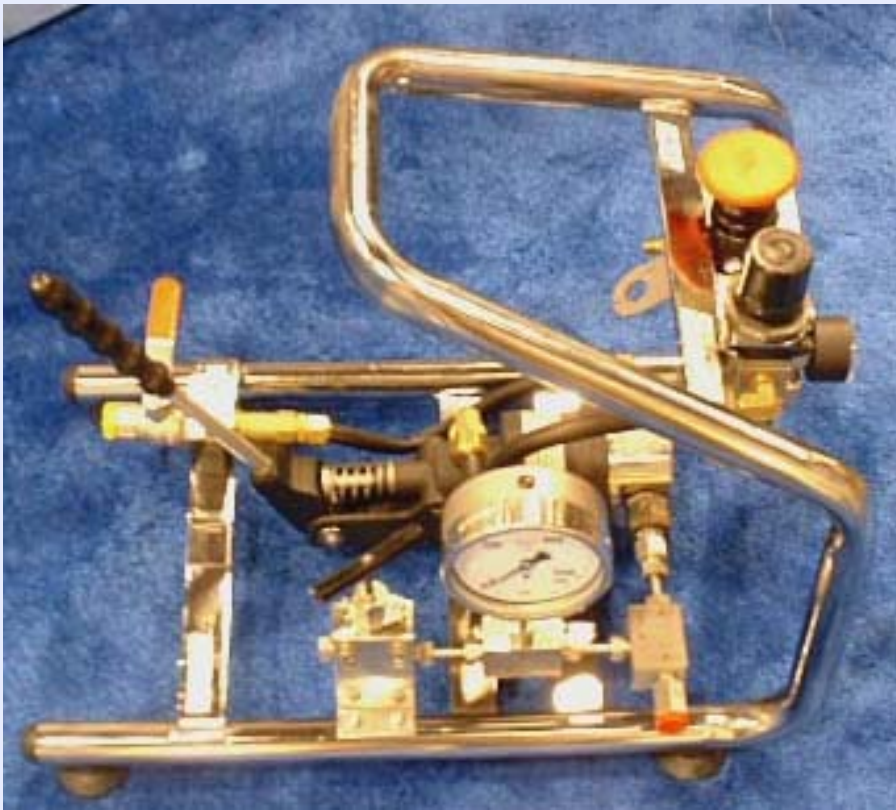
SPRAGUE SM-3 PUMP